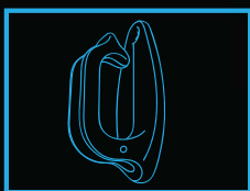
Secures to doors and walls

Chelsea Clips are simple to install and prices start at just £2.55